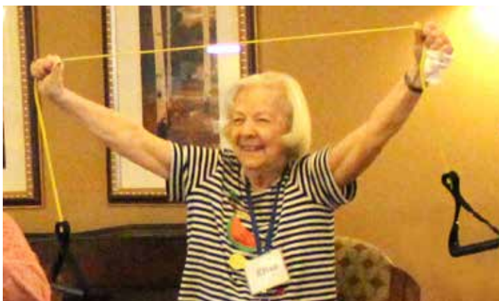
Get Stronger (Physical Fitness)