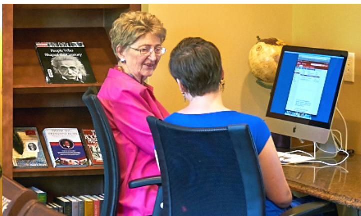
Build Your Brain (Brain Fitness)